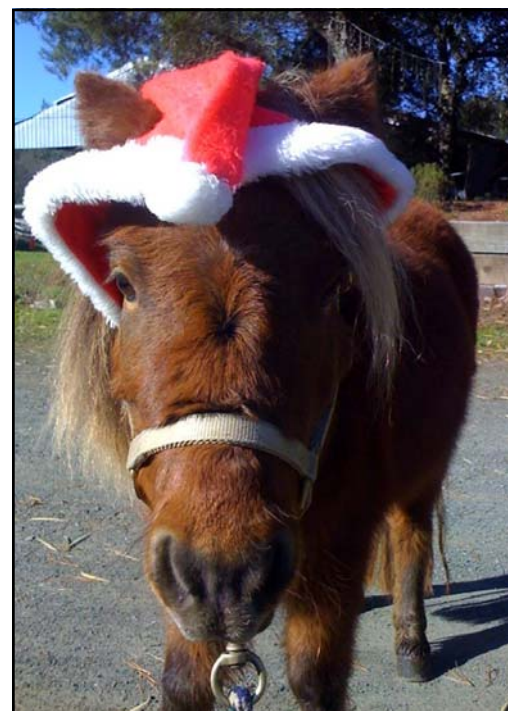
Pogo wishes everyone a happy holiday season!

Pogo's holiday wish list may be the most ambitious of them all, but she is