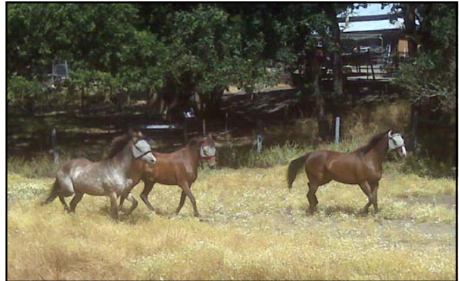
Equi-Ed horses Little Bit, Penny, and Cisco check out their new digs at Camp Silvano.

Within weeks of arriving at Camp Silvano, it was time for Equi-Ed's 10th Annual Ride-A-Thon. With the theme of Race for Equi-Ed , retired jockey and